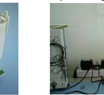
Power LED pointer in operation)