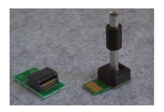
RGB Power LED (COB)

The RGB Power LED (COB) module is designed for the illumination of side light fibers like SL POF, fiber bundles or other "thick" optical fibers. The module's transmit colour can be switched electrically. 3 power LED dice (40mil size) are COB (chip on board) mounted on a thermally excellent conductive submount. Heat is dissipated via a soldered copper ferrule and allows an overall applied electrical power of up to 1W to the module.